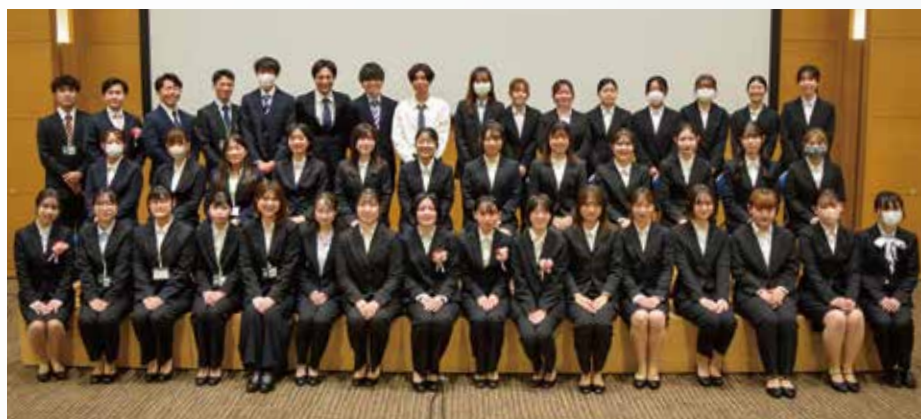
Closing ceremony (Fukuoka International Congress Center)