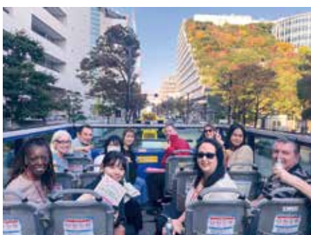
MICE Showcase & FAM trip (Open Top Bus)