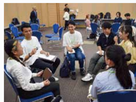
Group work during a lecture (Fukuoka International Congress Center)