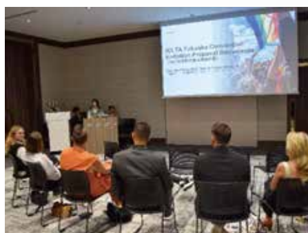
International conference seminar in English (Daimyo Conference)