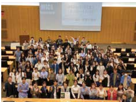
Opening ceremony (ACROS Fukuoka)