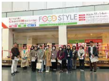
Assisting at a large-scale exhibition (Marine Messe Fukuoka)