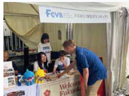
Information booth during the World Aquatics competition (JR Hakata Station Square)