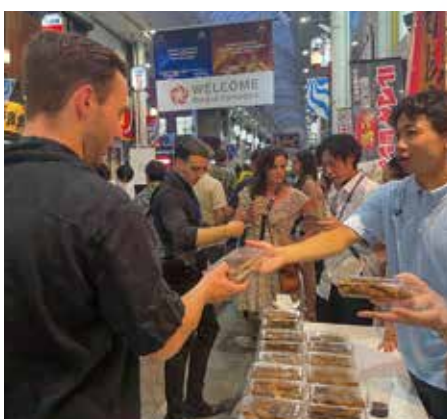
Reception at an international conference (Kawabata Shopping Arcade)